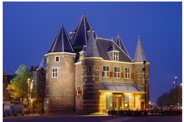
The Weigh House ("De Waag") in Amsterdam

SMWCon Fall 2010 is the 5th International Semantic MediaWiki Conference. It will be held on the weekend of September 18–19, 2010 at the Open Universiteit in Amsterdam, the Netherlands. The conference provides an informal and engaging environment for discussing cutting-edge and emerging Semantic MediaWiki tools, extensions and applications.